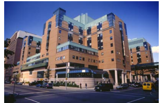
Hospital for Sick Children Atrium Site, Toronto 22% reduction in energy use since 2004 and $1 million in savings in 2009