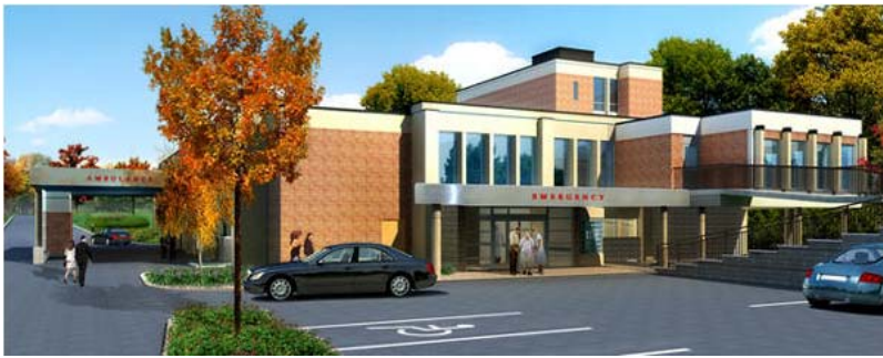
Arnprior & District Memorial Hospital - member since 2007 applying its experience to its new redevelopment.

Greening Health Care is the largest program of its kind in North America, helping hospitals work together to lower their energy costs, raise their environmental performance and contribute to the health and wellbeing of their communities. Members manage data, assess their performance and track savings using a powerful online system. They share knowledge and best practices through workshops, webinars and networking to help plan, implement and verify improvements. This is a program of The Living City managed by Toronto and Region Conservation.